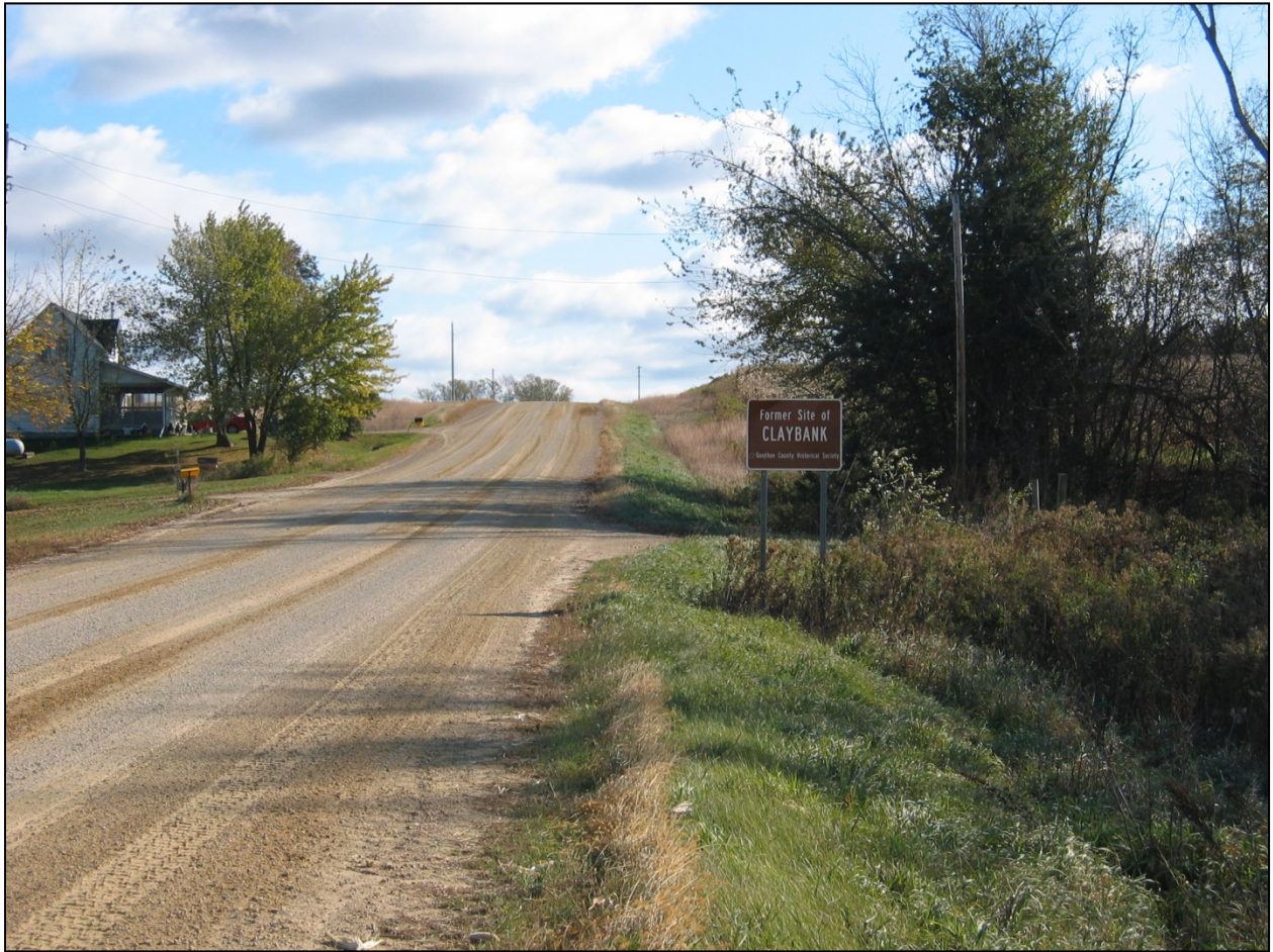
Goodhue County Picture, 2011