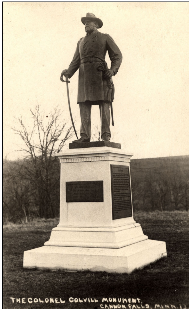
Goodhue County Historical Society Picture