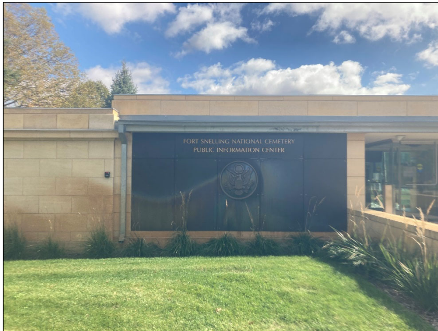
Fort Snelling National Cemetery.