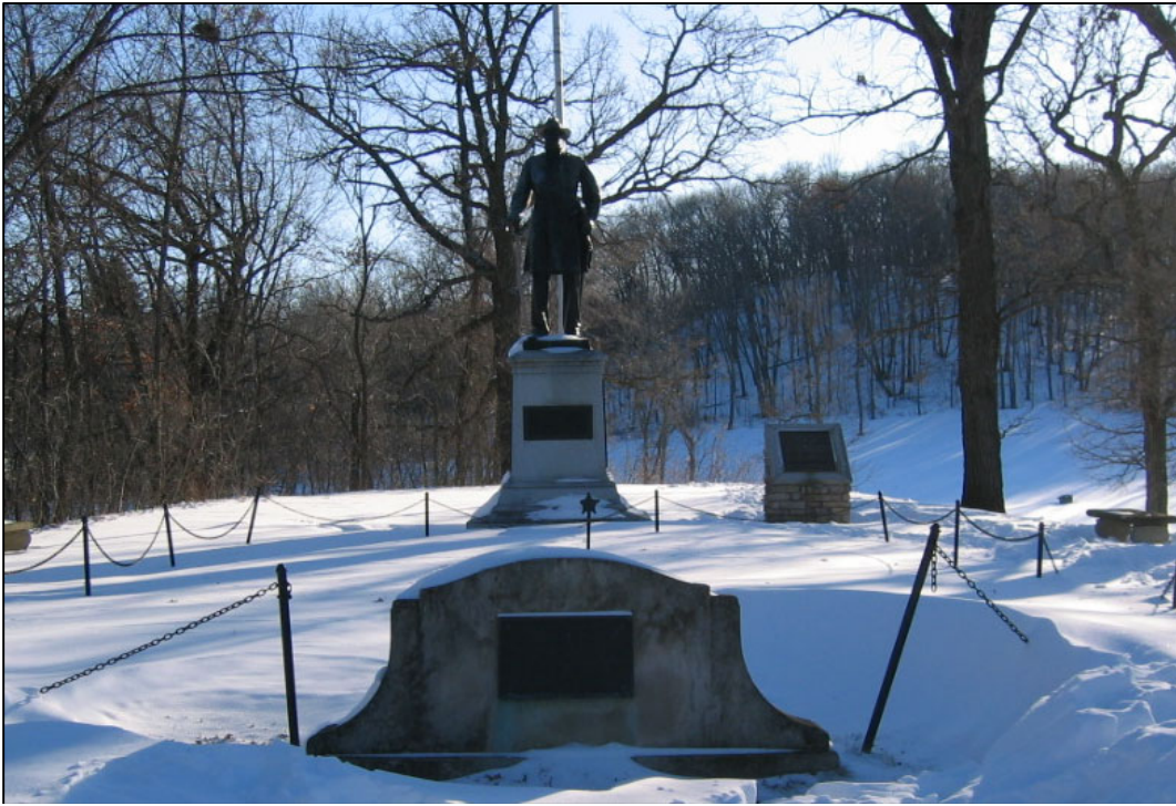
Goodhue County Picture, 2009