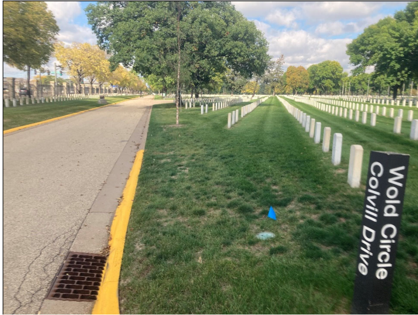
Colvill Drive at Fort Snelling National Cemetery.