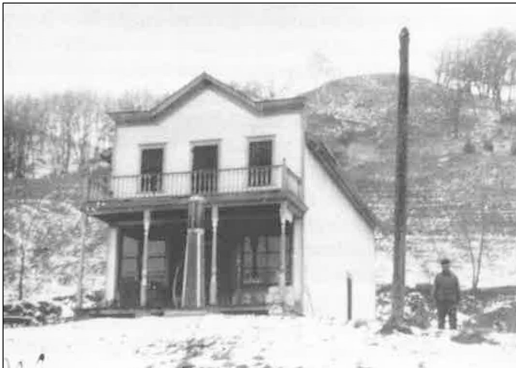
Nilan Store, 1880's