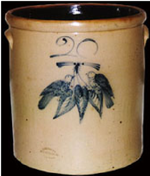
20 gallon Red Wing salt glazed stoneware.