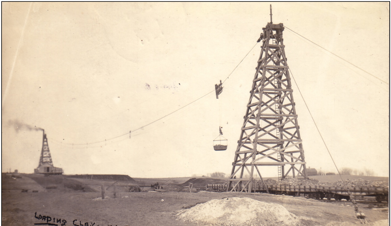
Typical Goodhue County clay pit mining operation, 1880's