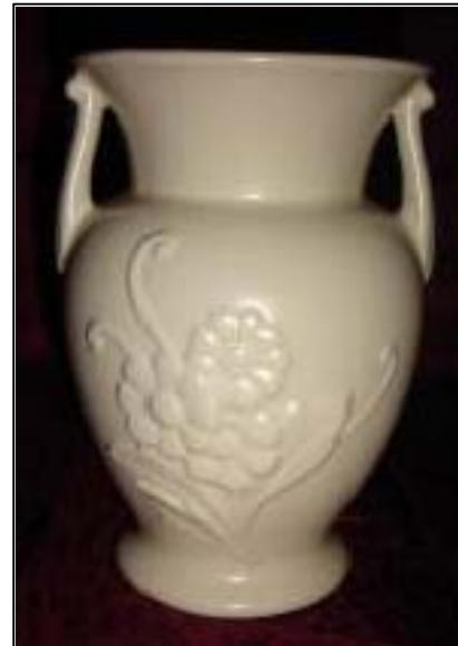
6" Red Wing artware bud vase.