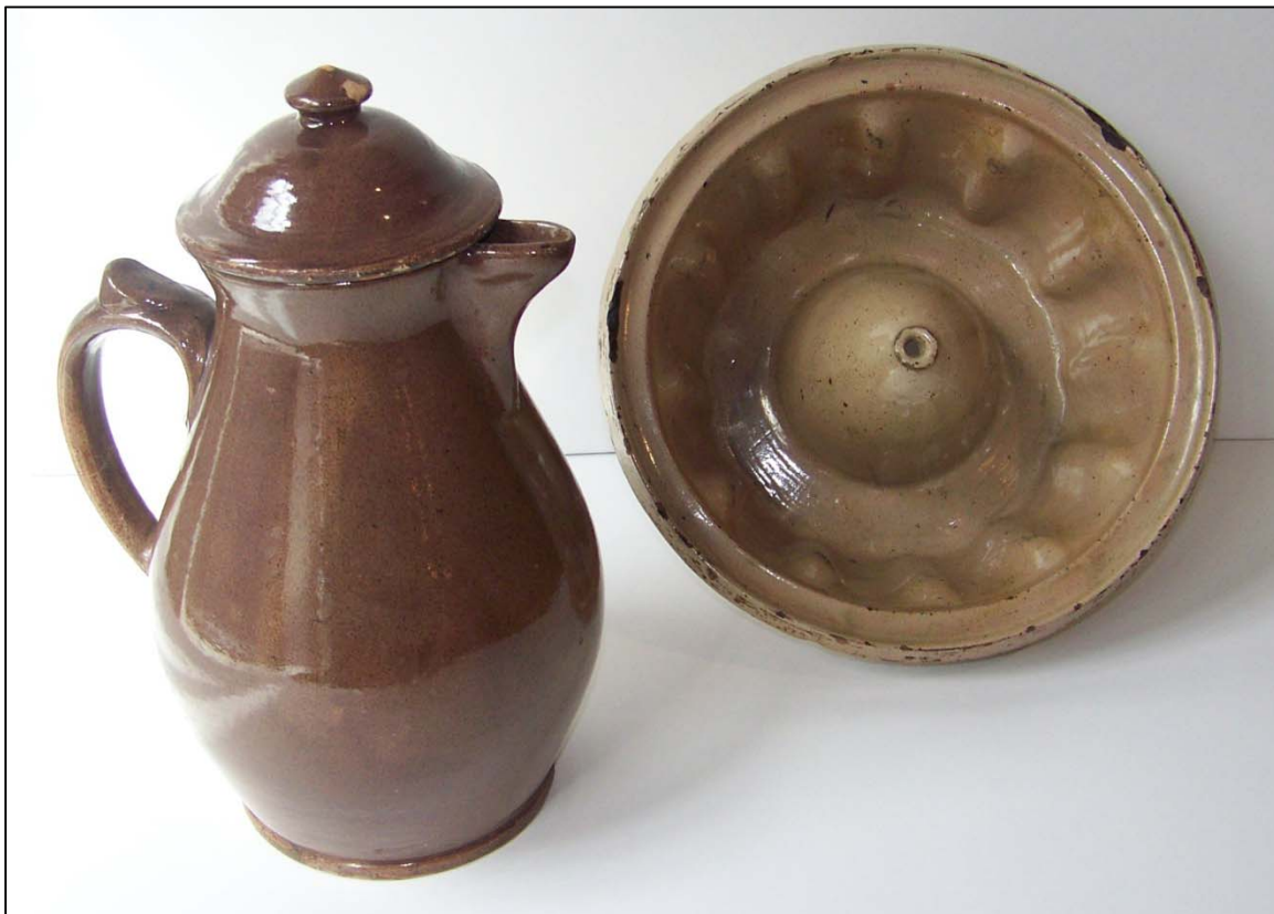
Examples of John Paul pottery.