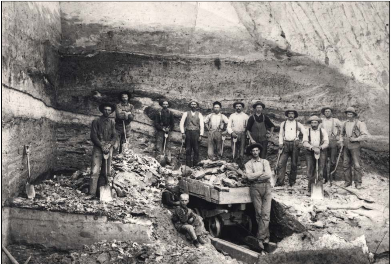
Typical Goodhue County clay pit mining operation, 1880's, Picture courtesy of Goodhue County Historical Society