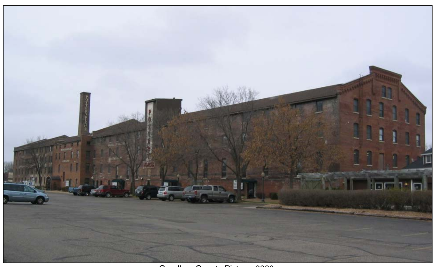
Goodhue County Picture, 2009