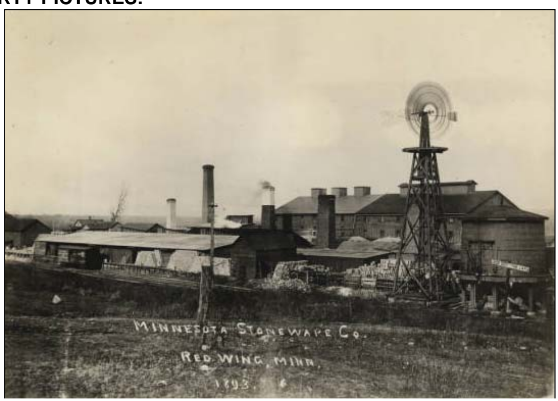
Goodhue County Historical Society Picture