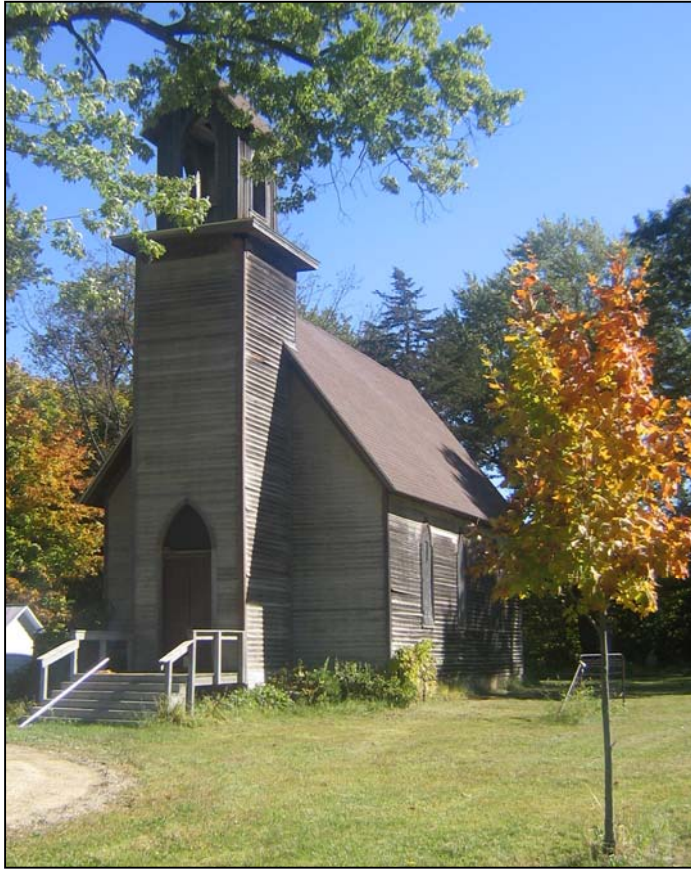
St. Paul's Episcopal Church at Chapel Hill. Goodhue County Picture, 2003