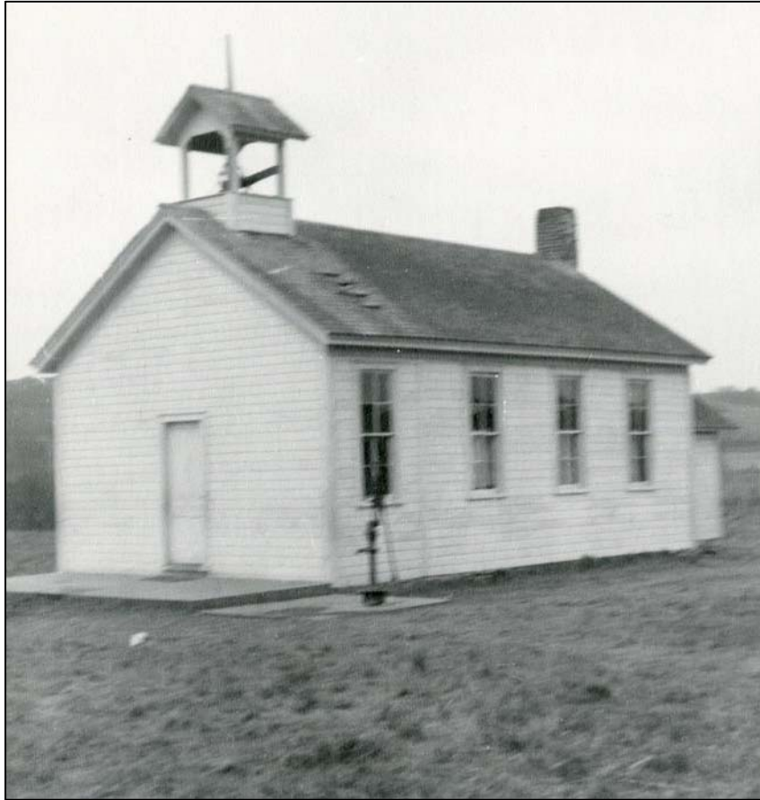
School House #39 – Schweiger-Chandler School.