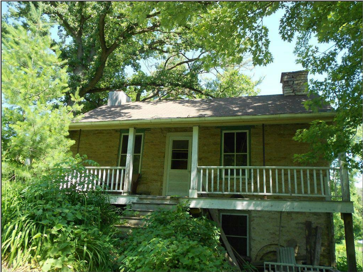
Samuel P. Chandler House.