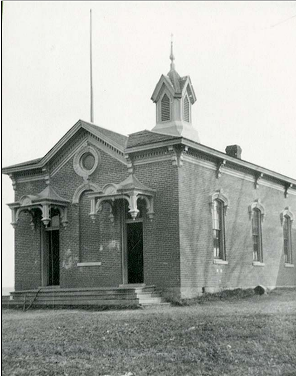
Rural schoolhouse #115, Featherstone Prairie School.