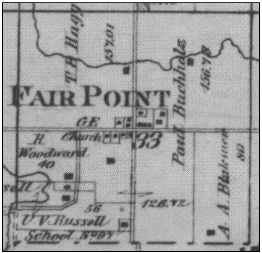
1877 Goodhue County Plat Book, Cherry Grove Township, Section 33