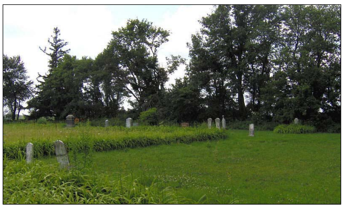
Fairpoint cemetery, 2010.