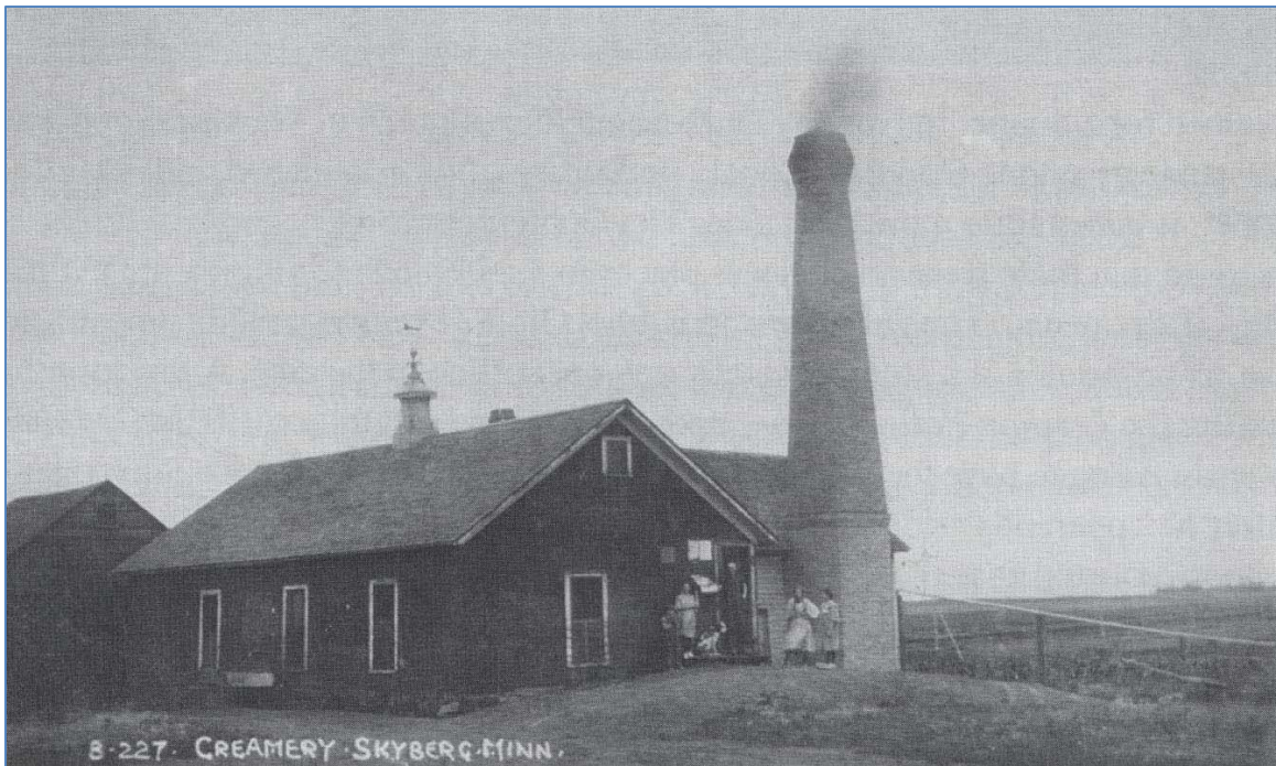
Skyberg Creamery, 1920's