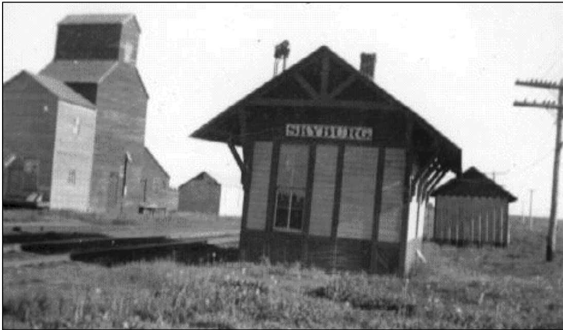
Skyberg train depot and grain elevator.